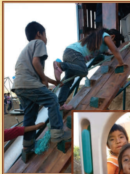
The new playground is complete with a playhouse, accessed by a climbing ramp and exited via a slide!